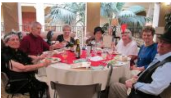
Residents dressed in their Roaring '20s costumes!