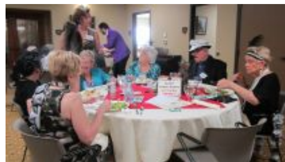
Are you the Murderer??