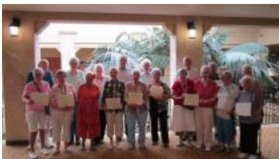
Fall Semester Starting in September! Look for In-house Flyers for Dates!