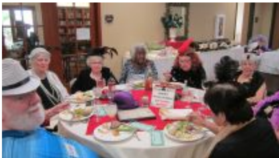
Enjoying a good meal during the murder mystery dinner.