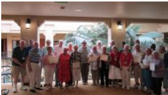
Summer Semester Graduates From SDSU Senior University at Paradise Village